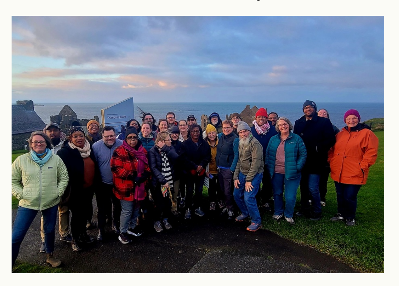
Retreat Group at Dunluce Castle