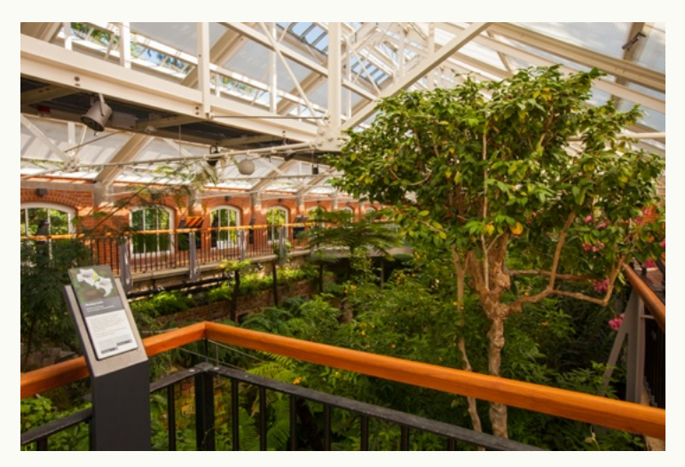
Tropical Ravine, Botanic Gardens

"This is a fabulous opportunity to experience the physical beauty, the political culture and history and the warm, friendly people of Ireland. Also an opportunity to slow down, reflect and connect with interesting, diverse people in substantive, heart-level ways."