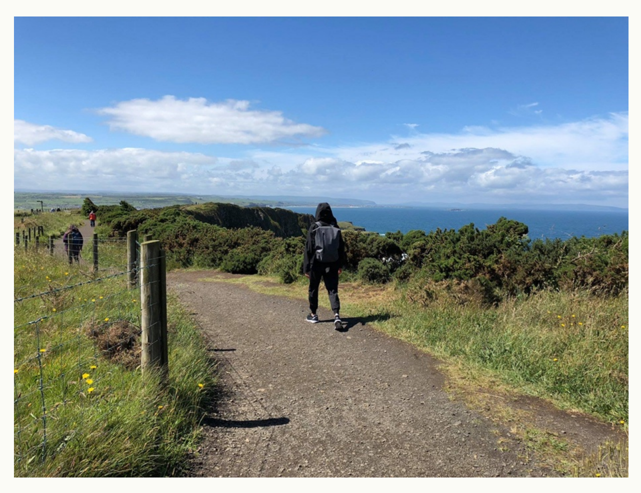
Wandering the North Coast